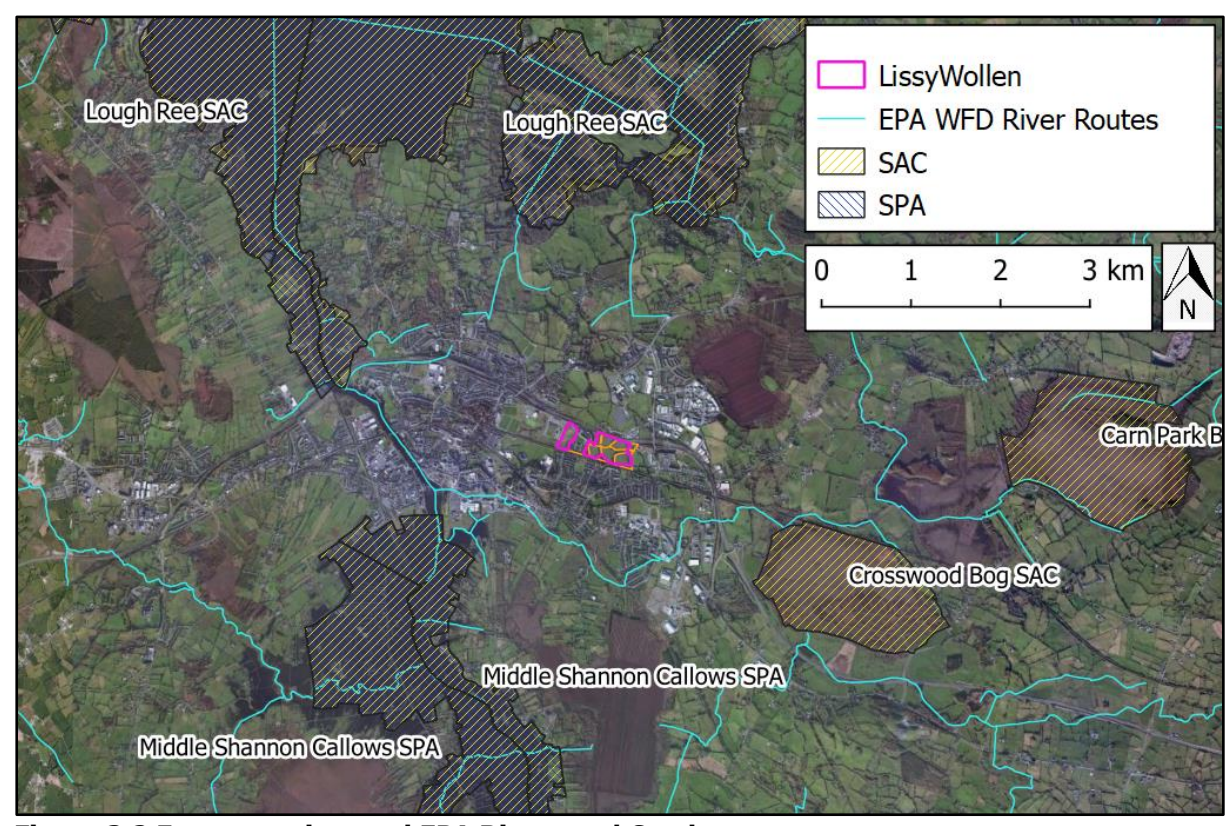
Figure 3.2 European sites and EPA Rivers and Catchments